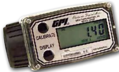
A1 series Nylon