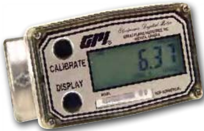
A1 series Aluminium

A1 commercial grade meters are low cost turbines in aluminium and nylon for fuel and water applications. Flow rates up to 1135L/min. LCD readout with flow rate, accumulated total and batch totals and permanent field calibration feature make these meters excellent value. Accuracy is ±1.5%.